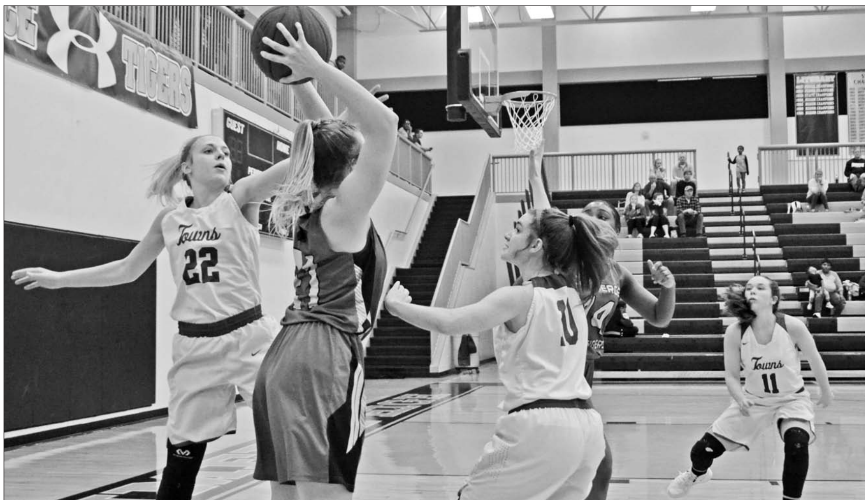
The Towns County Lady Indians in action vs Commerce during the opening round of last week's Region 8-A Tournament.

The losing team in earlier games often learns a lot about what is needed for improvement and in the case of the Lady Tigers, dealing with the tenacious defense of the