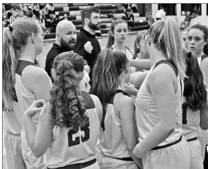
Towns County is the No. 14 seed in the upcoming Class A Public State Tournament.

Just a slight change brought about by the appeals process could result in the Lady Indians facing Lake Oconee Academy, a charter school from Greensboro near Athens, and an unlikely drastic change might bring about a still different